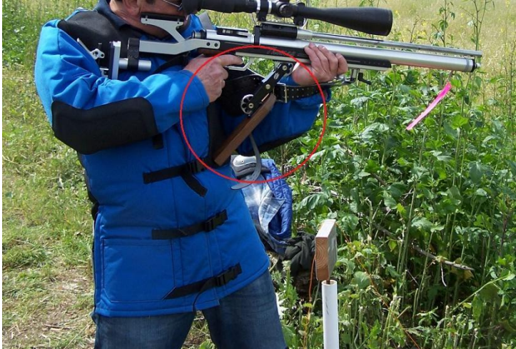
Not Allowed: Other than using a sling, the gun is to be supported solely by the hands, shoulder, and cheek.