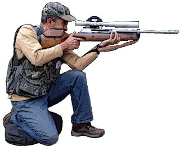
This is a typical allowed Kneeling position. NOTE: <u>WFTF Rules</u> allow only a kneeling roll for rear instep support.

A. An allowance for additional padding to fit between the thigh & the calf/foot can be requested from the Match Director prior to the start of a match. The pad cannot be larger than a legal-size kneeling roll. It will be at the Match Director's discretion to accept or deny any request.